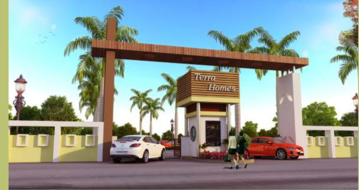
TERRA HOMES (Dewa Road)