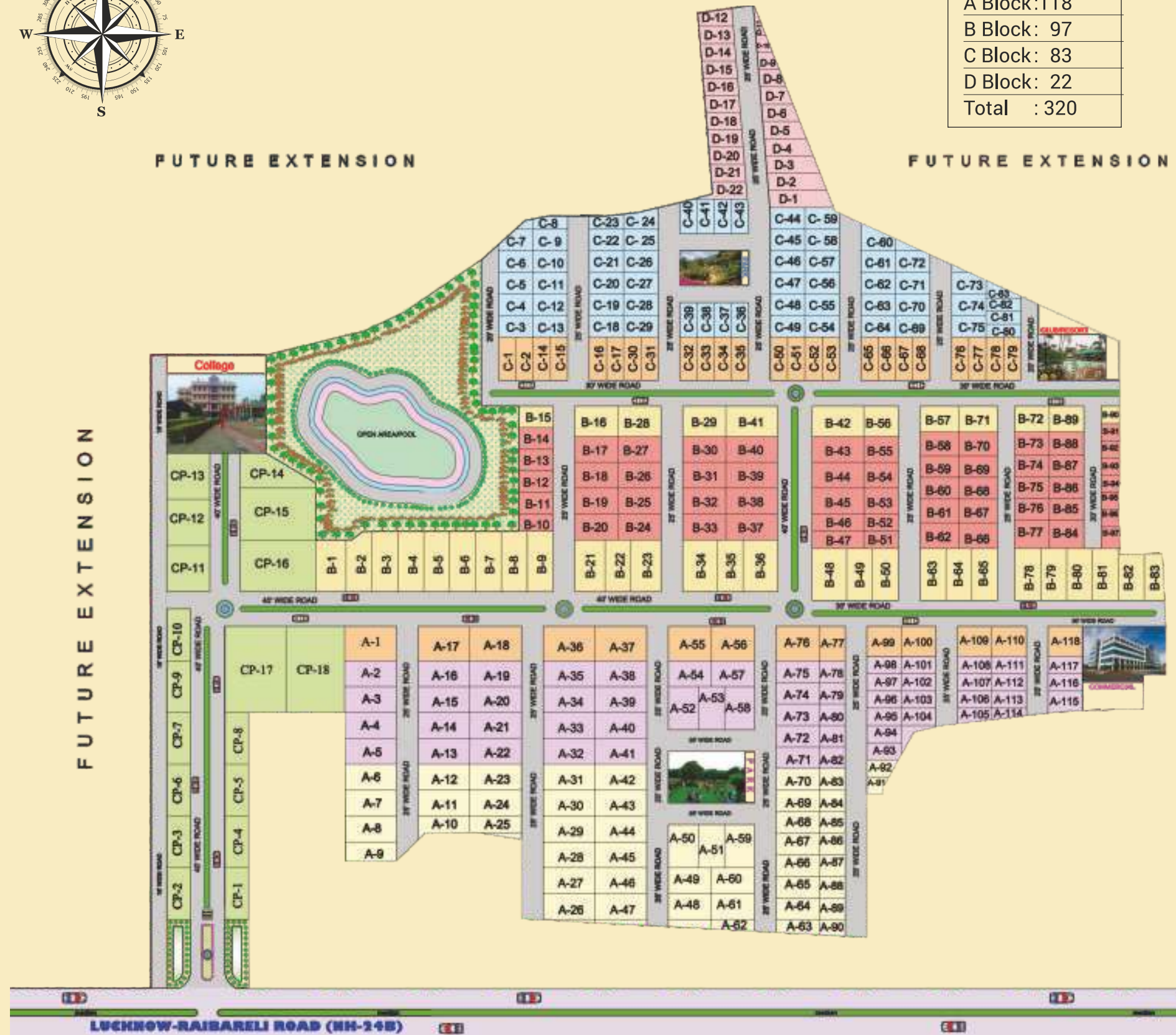
TERRA GARDEN LAYOUT PLAN