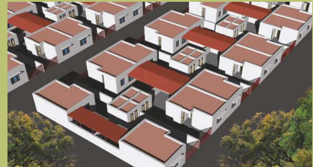
Sankalp Awasiya Yojna (Lucknow Raebarely Raod)